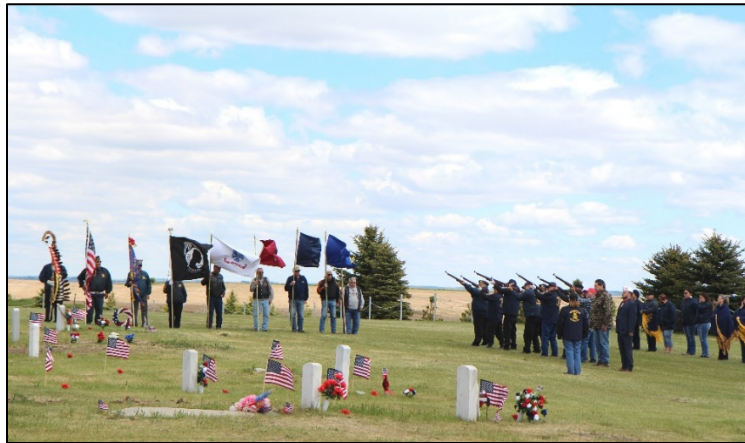
Legion and Auxiliary take part in honoring at Old Scout's cemetery.