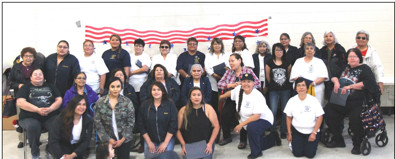
Auxiliary members who attended Celebration