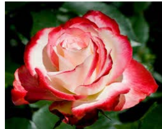
Red tipped White Rose