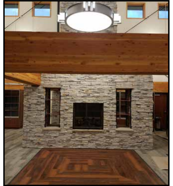
Twin Buttes Elder Center (Gathering Space)