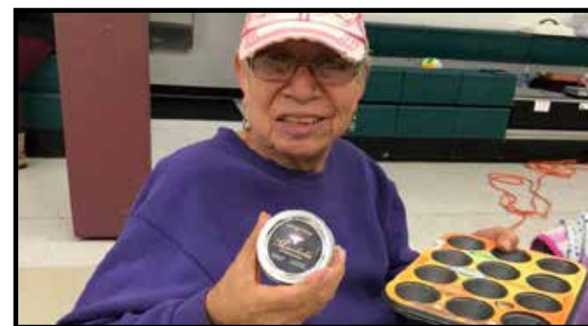
Raven Heart 3 rd Place Winner of Recipe Contest