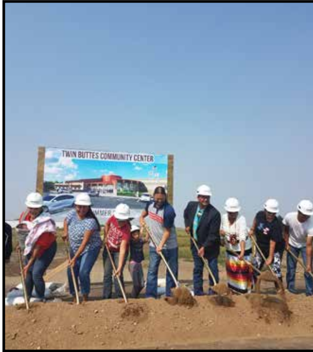
Twin Buttes Community Center Ground Blessing