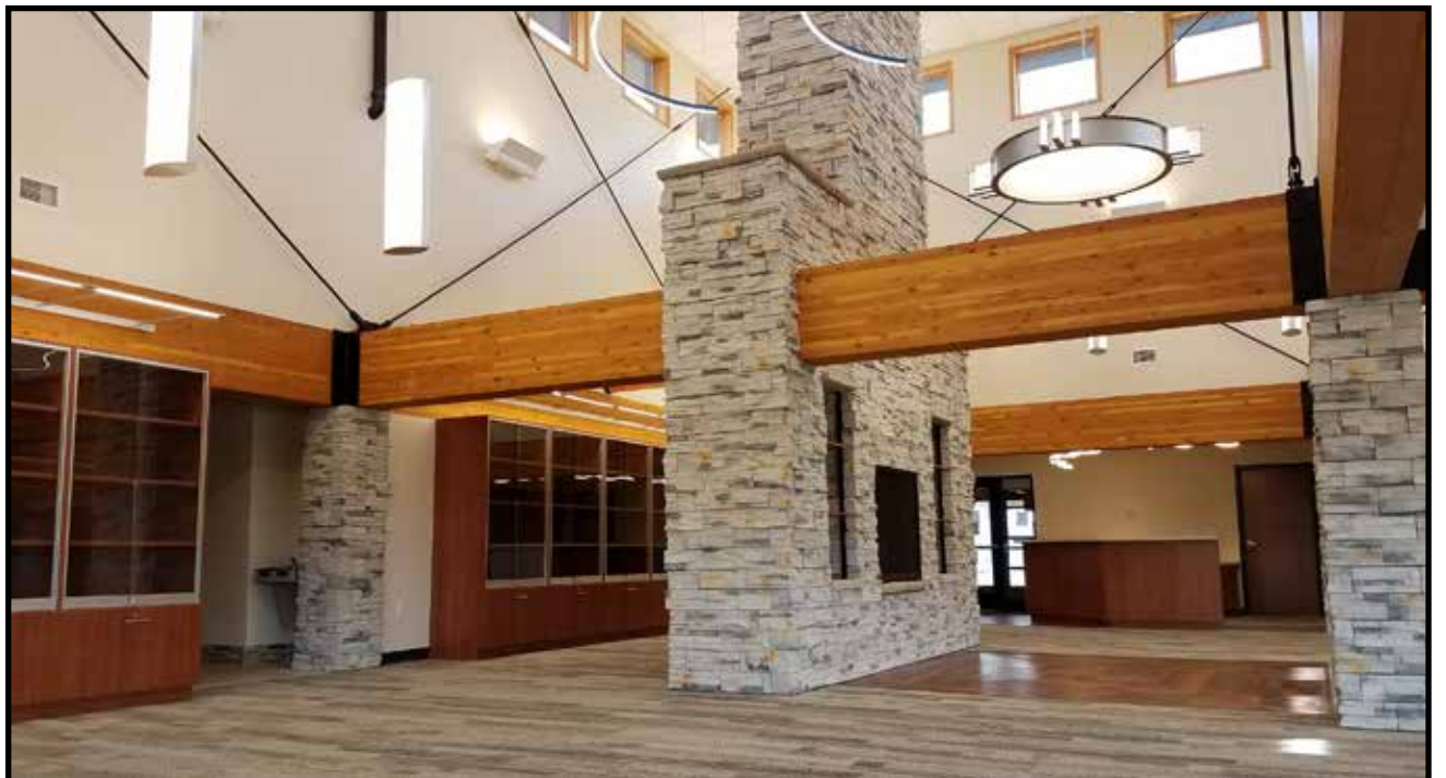
Twin Buttes Elder Center (Gathering Space)