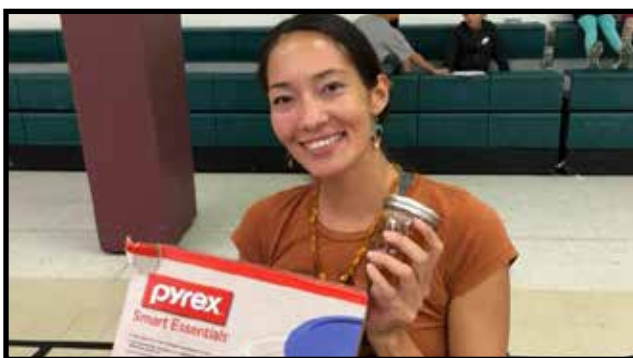
Wind Spirit Spotted Bear 2 nd Place Winner of Recipe Contest