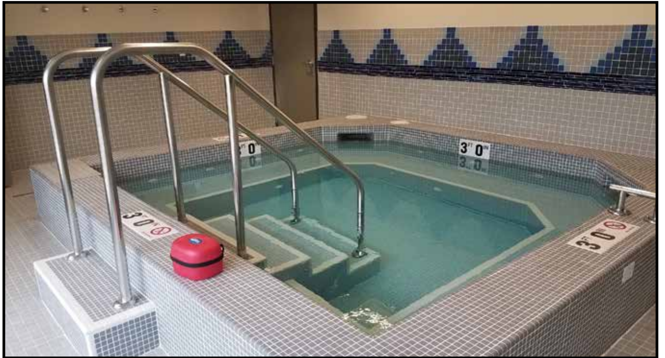
Twin Buttes Elder Center (Hydrotherapy Spa)