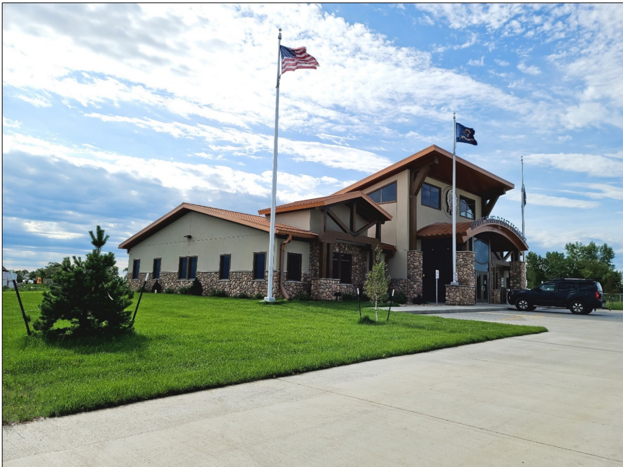
The Administration Building is located about ½ mile east of the White Shield Culture Center.