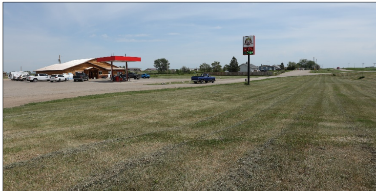
The Nishe Store gets cleaning